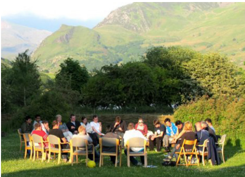
Trigonos Centre, North Wales

The final module is planned to take place at Trigonos, Snowdonia, North Wales. This is close to Penmeanmawr, a druid stone circle where Dr Ita Wegman had conversations with Rudolf Steiner, which were seminal to the development of Anthroposophic Medicine and the General Anthroposophical Society.