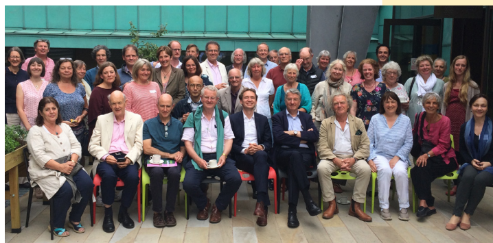
Is there a place for the Spirit in Medicine and Science? June 2018 conference at The University of Westminster