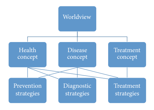
FIGURE 2: Worldviews, concepts, and clinical practice.

health is the result of a self-regulating inner activity, and (2) health is aimed at restoring wholeness of the organism and balance within or between the functions of body, soul, and spirit [24, 65]. In agreement with the health concept, health promotion can be logically defined as the process of enabling